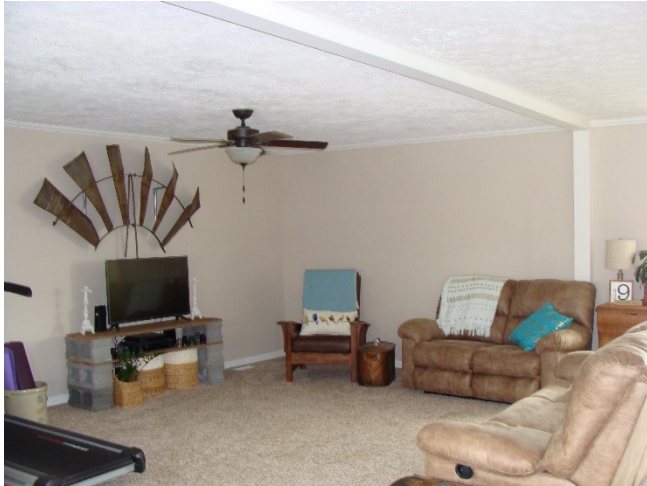
Living Room - 26' x 16'7"