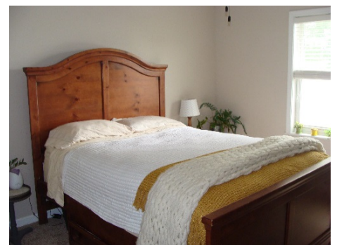
Master Bedroom - 12'6" x 11'4"