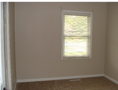
Bedroom - 11' x 9'2"