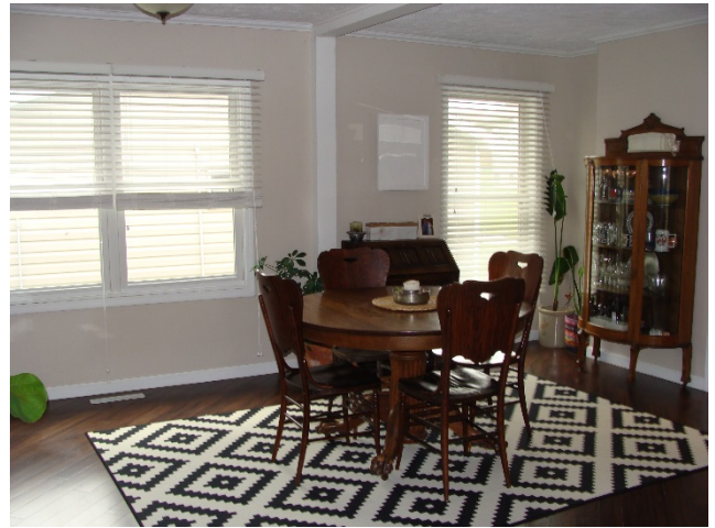
Dining Room - 15'8" x 10'9"