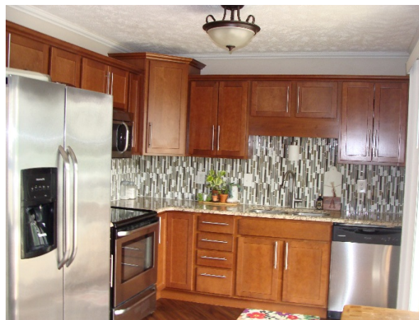
Kitchen - 9'2" x 10'4"