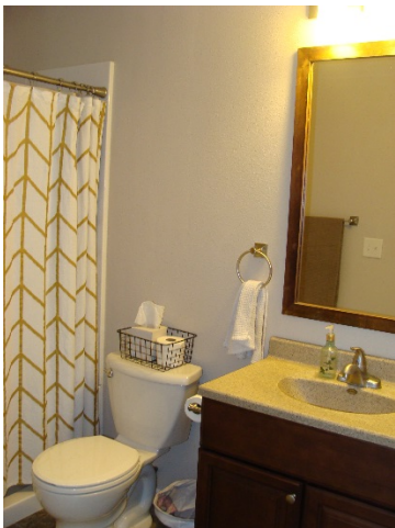
Bath - 5-1" x 10'4"