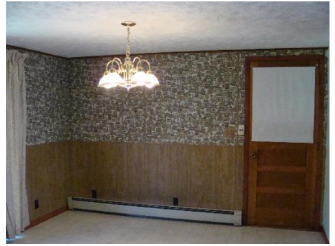
Kitchen/Dining Room – 20'3" x 11'6"