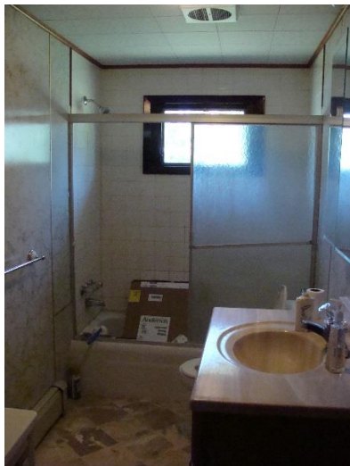
Bathroom – 14'5" x 4'11"