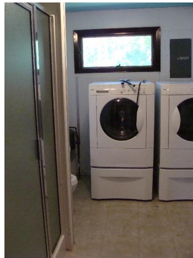
Bathroom/Utility Room – 8' x 11'5"