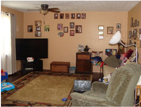
Living Room - 21'1 1/2" x 14' 1/2"