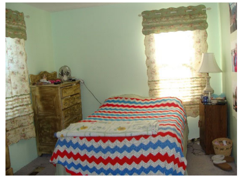
Master Bedroom - 9'5" x 14'10"