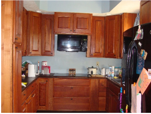
Kitchen - 21'7 1/2" x 9'5 1/2"