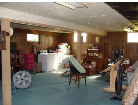
Basement - 31'8" x 20'9"