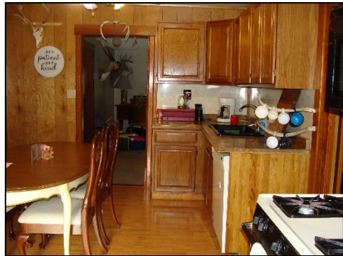
Kitchen – 10'6" x 17' 11"