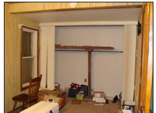
Bedroom 8'8" x 17'11"