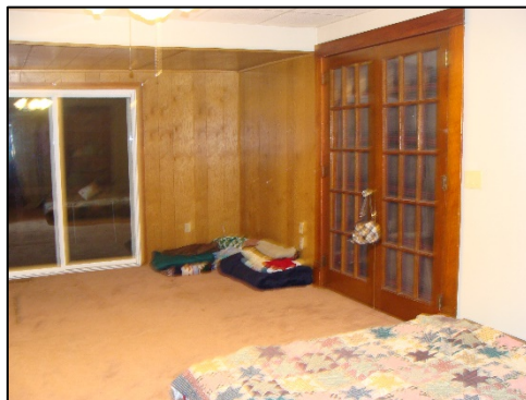
Bedroom – 21'3" x 12'11"