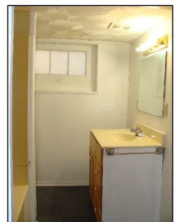
Basement Full Bath 6'8" x 8'10"