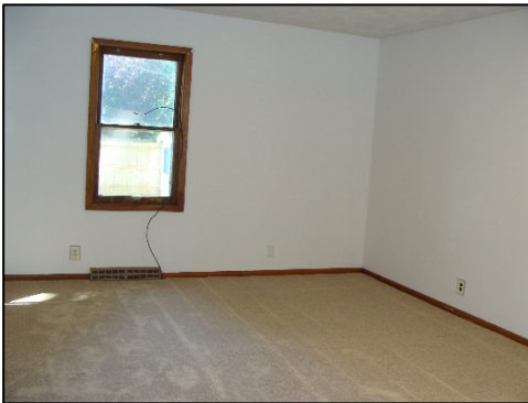
Bedroom – 11'10" x 16'6"