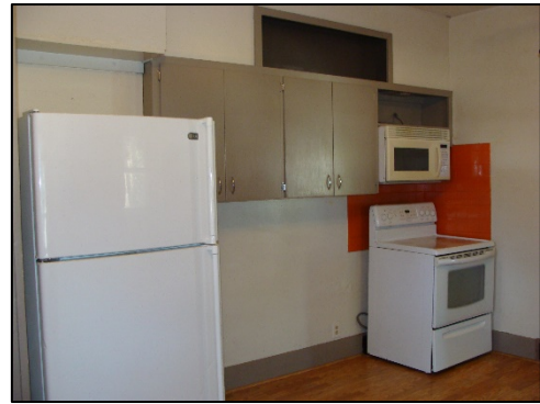
Kitchen – 10'2" x 15'3"