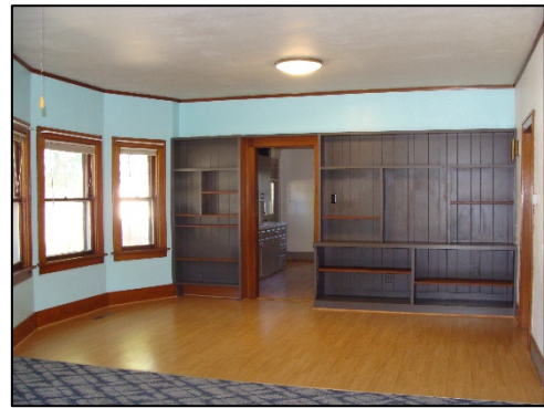
Living Room /Dining Room – 16' x 25'