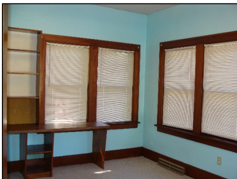
Office/Bedroom – 12'2" x 10'4"