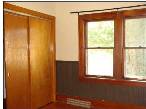
Bedroom –12'4" x 10' 1"