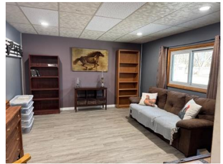
Living Room – 15'3" x 13'7"