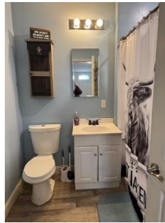
Master Bath – 7'9" x 7'4"