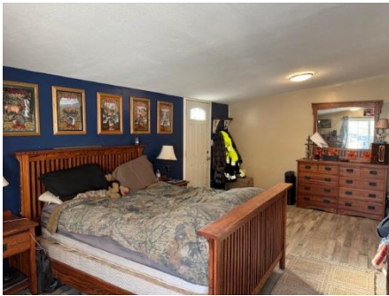
Master Bedroom – 11'6" x 20'1"