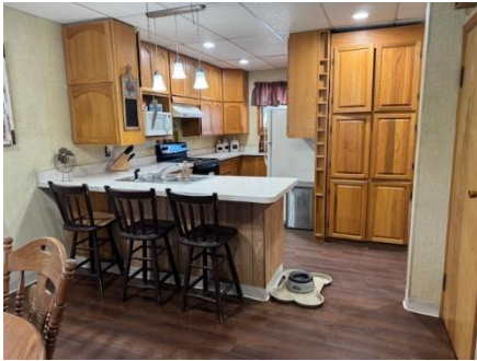
Kitchen 15'8" x 13'9"