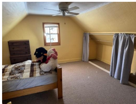
Bedroom- 15'4" x 13'9"