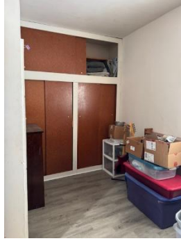
Bedroom - 13'6" x 9'6"