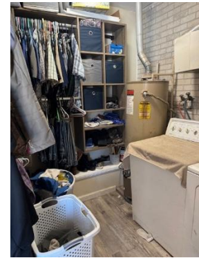
Utility room – 7'8" x 7'11"