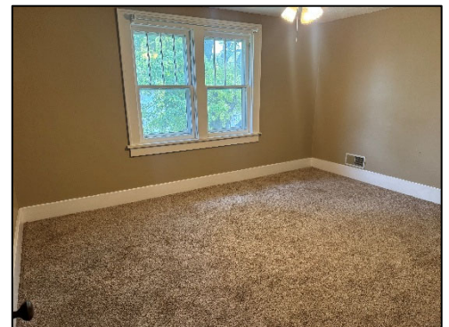
Bedroom – 14'4" x 11'7"