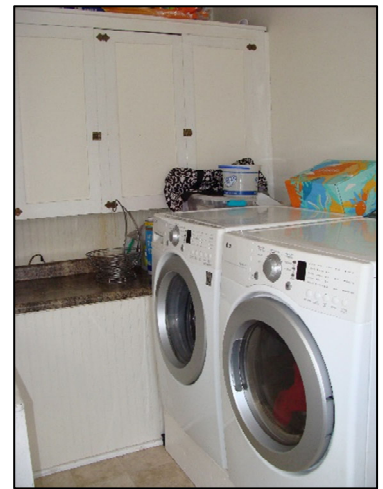
Laundry – 13' x 8'6"