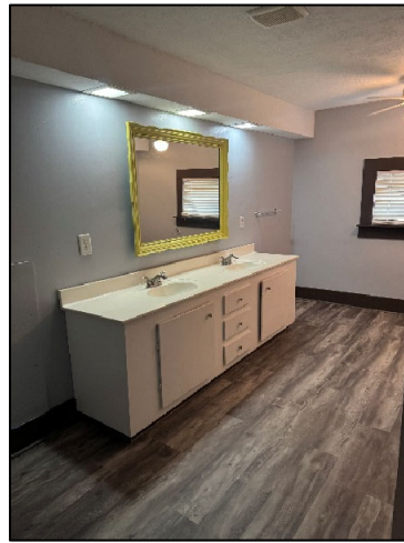
Bathroom – 15'7" x 9'6"