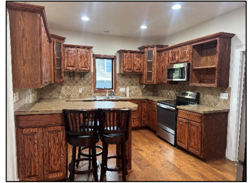
Kitchen – 15'5" x 11'5"