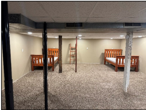
Family Room 21'7" x 29'11"