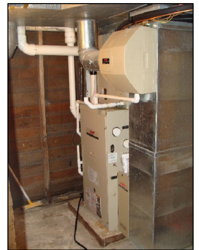
New A/C 2020