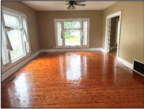
Living Room – 14' x 22'2"