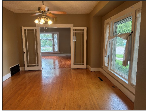
Dining Room – 14'2" x 13'