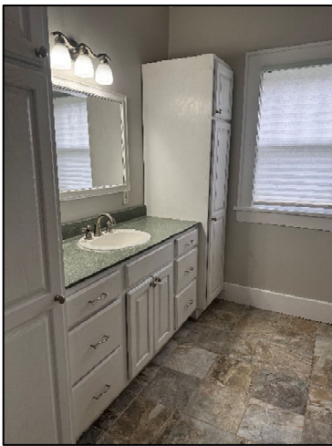
Central Bath – 8'1" x 8'3"