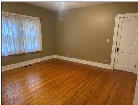
Master Bedroom – 14'4" x 15'3"