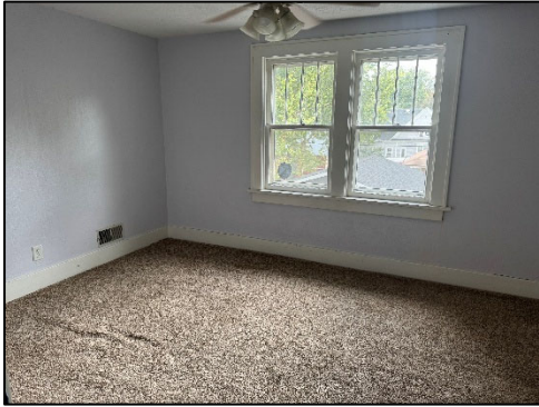
Bedroom – 14'3" x 11'3"