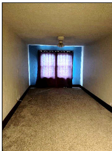
Upstairs Landing - 17'11" x 9'6"