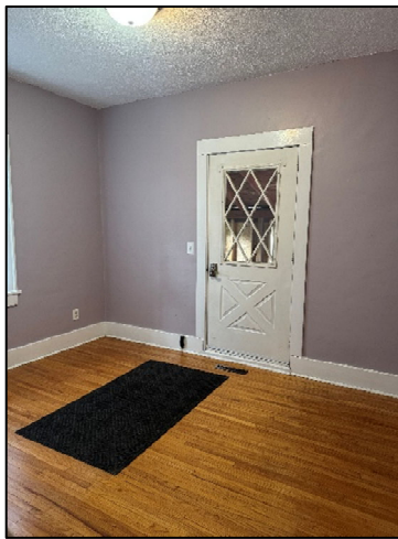
Office – 12' x 10'2"