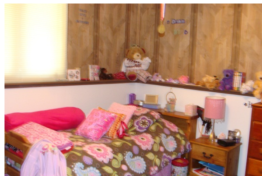
Bedroom – 9'10" x 12'9"