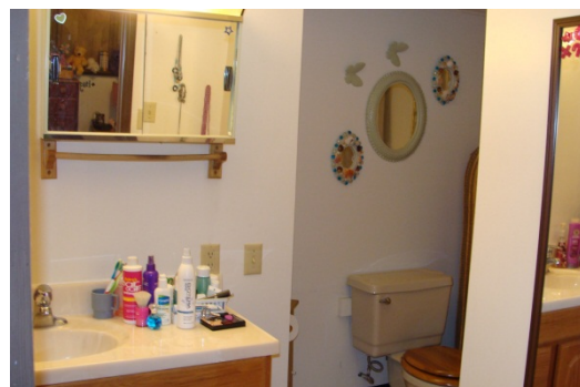
Bath – 6'9" x 10'11"