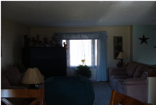
Living Room – 13'10" x 13'2"