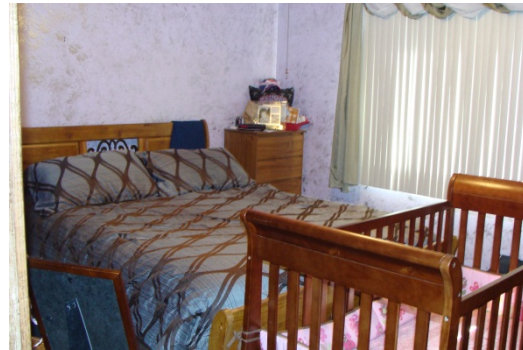
Master Bedroom – 11' x 12'2"