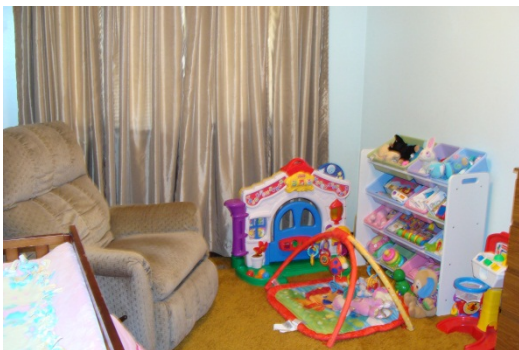
Bedroom – 8'11" x 13'10"