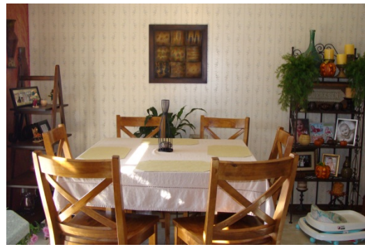
Dining Room – 9'7" x 11'2"