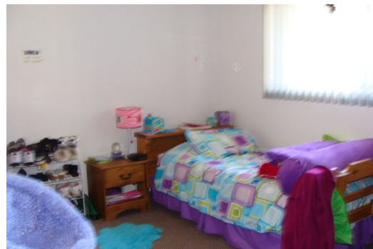
Bedroom – 12'2" x 10'1"