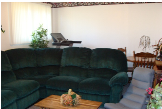
Family Room – 13' x 18'7"