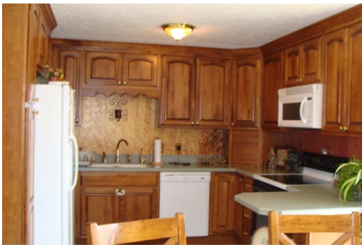
Kitchen – 10'2" x 9'9"