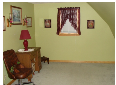
Bedroom – 15'3" x 9'11"