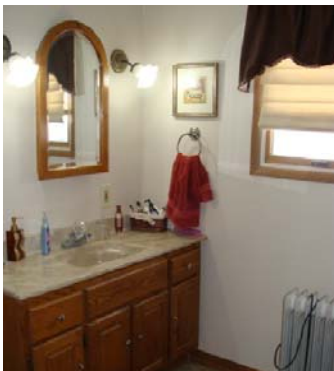
Bath – 11'2" x 11'5"