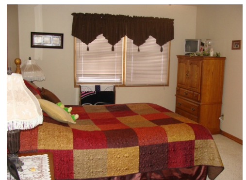
Master Bedroom – 11'7" x 21'8"