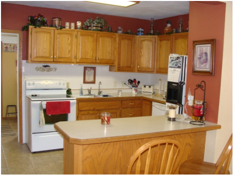
Kitchen – 13'2" x 10'