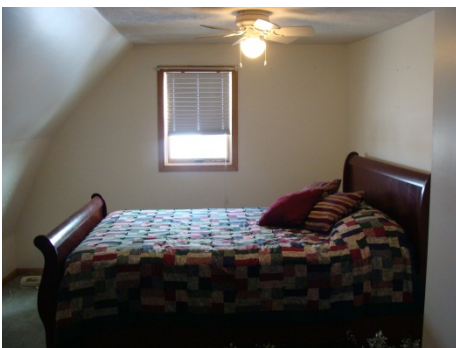
Bedroom – 19'5" x 10'2"