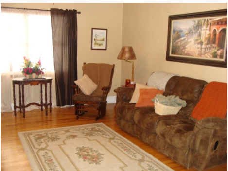
Living Room – 14'9" x 15'