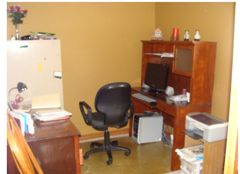
Office – 7'5" x 9'8"