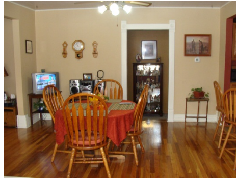
Dining Room – 21'4" x 13'6"