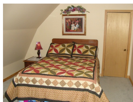
Bedroom – 9'10" x 15'6"