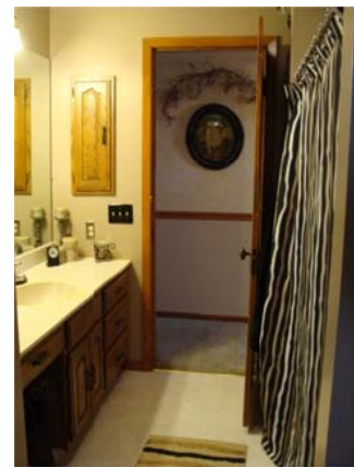
Master Bath – 11'1" x 7'6"