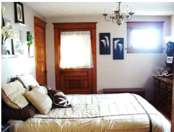
Master Bdrm – 15'8" x 11'2"