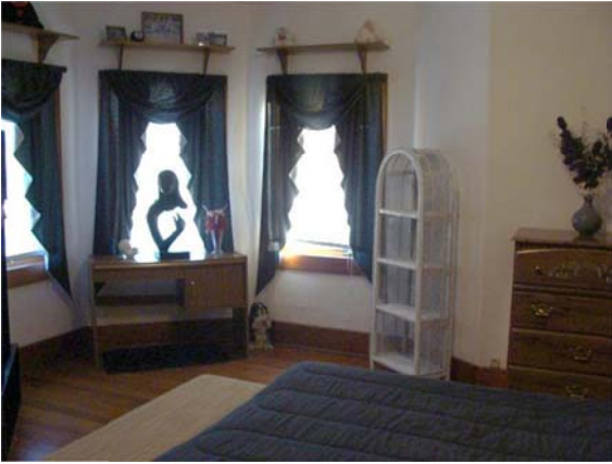
Bedroom – 13'6" x 12'11"