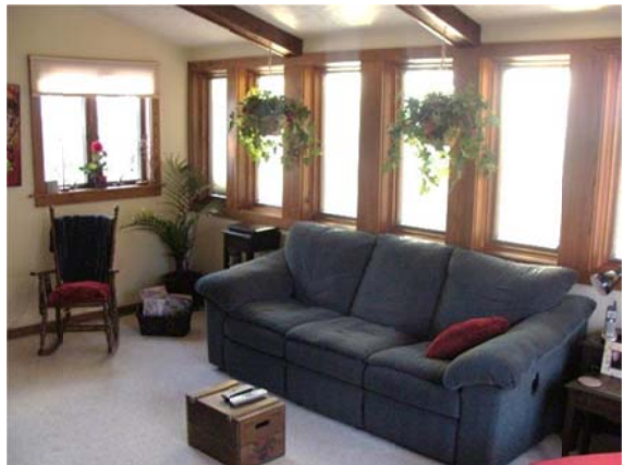
Sun Room – 11'6" x 18'11"