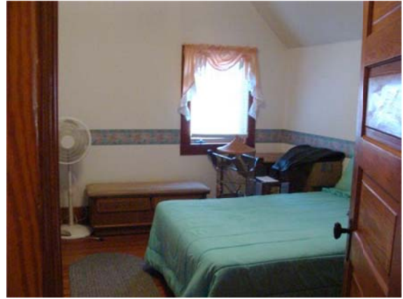
Bedroom – 13'2" x 11'9"