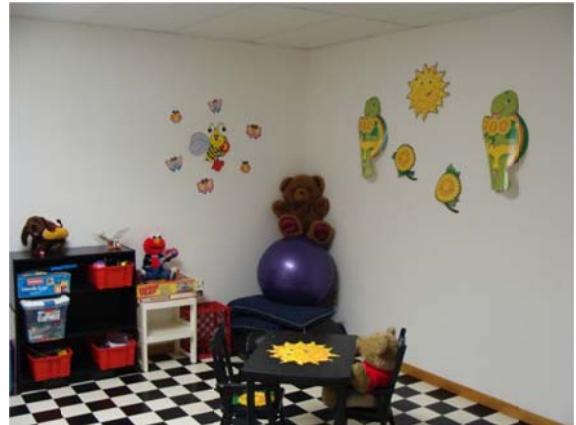
Toy Room – 12'6" x 13'10"