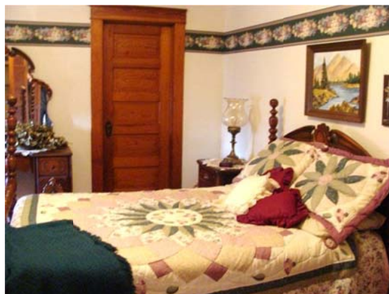
Bedroom – 13'2" x 13'2"