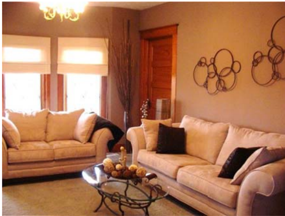
Living Room – 16'8" x 15'1"