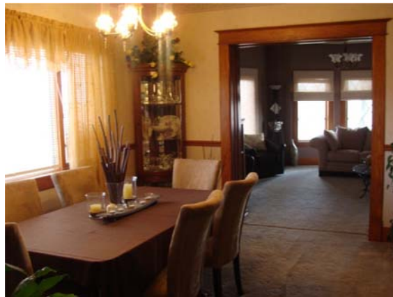
Dining Room – 14'3" x 13'5"