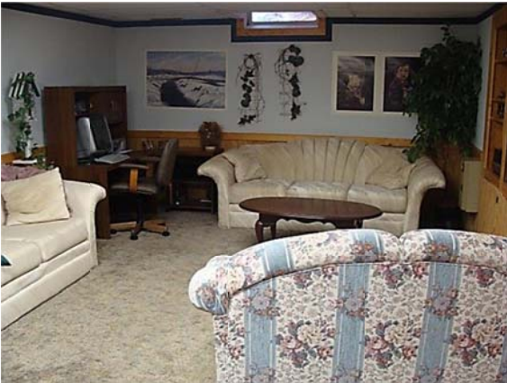
Family Room – 21'7" x 12'10"