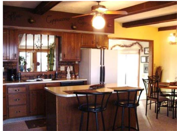
Eat-In Kitchen – 20'3" x 19'5"