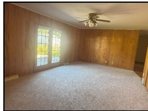
Family Room 13'2" x 21'7"