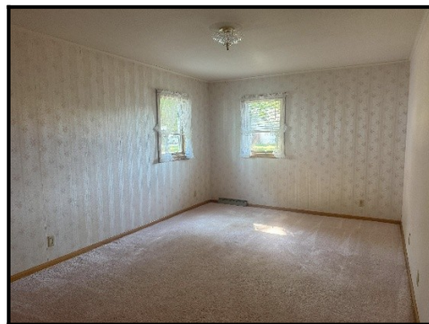
Bedroom – 17'6" x 11'