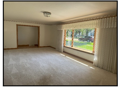
Living Room – 13'9" x 27'1"