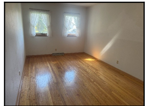
Bedroom – 17'6" x 9'11"

Not Pictured: Laundry/Bathroom – 10'6" x 10'3"