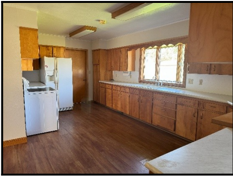
Kitchen 16'10" x 19"