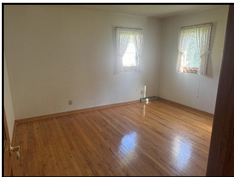
Bedroom – 11'9" x 13'