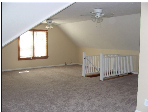
Master Bedroom – 28'5" x 27'4"