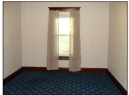
Bedroom – 10'2" x 13'