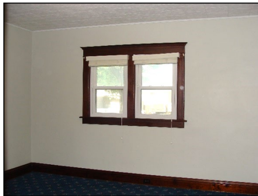
Bedroom – 13'1" x 13'4"