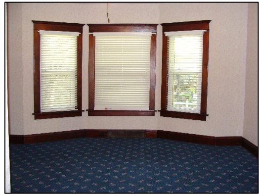
Dining Room – 15'4" x 15'3"