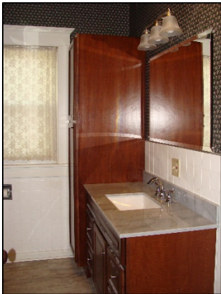
Bath – 6'10" x 8'9"