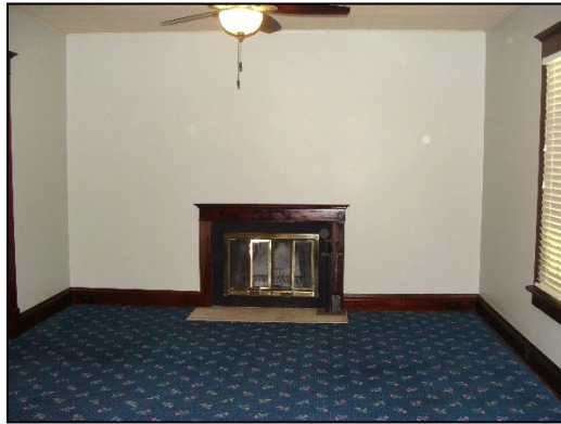
Living Room w/ fireplace – 13'2" x 15'3"