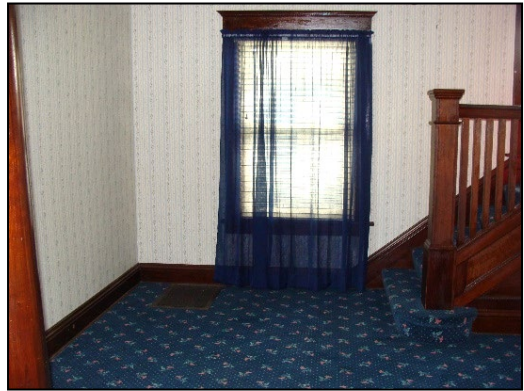
Foyer – 11'4" x 10'2"