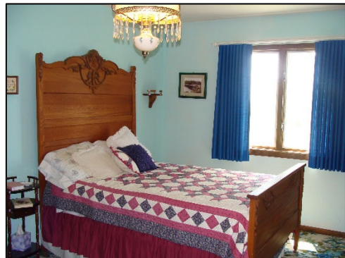
Bedroom - 15' 5" x 10'6"