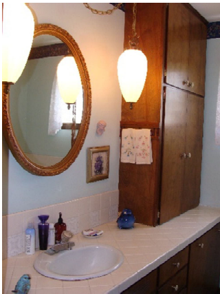
Central Bathroom - 7'8" x 6'10"