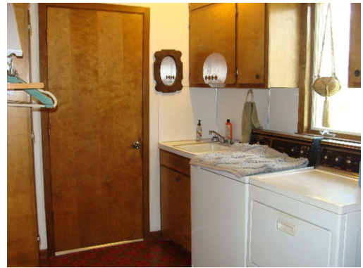
Laundry Rm - 8'2" x 9'6"