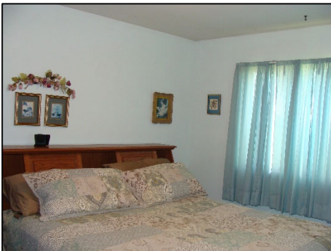
Bedroom - 11'4" x 13'5"