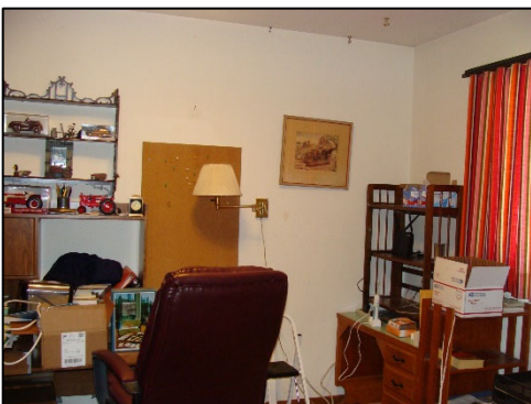
Bedroom /Office 9'8" x 9'7"