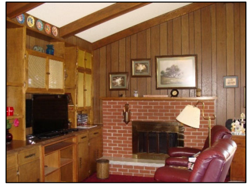
Eat in Kitchen and Living room with fireplace - 18'9" x 21'8"