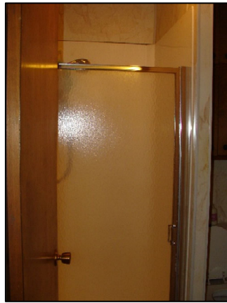
½ Bath - 5'1" x 4'11"