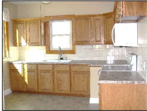
Kitchen – 10'9" x 11'5"