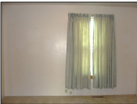
Bedroom - 12' 8" x 12' 10"