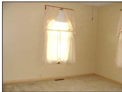
Bedroom – 12'8" x `2'8"