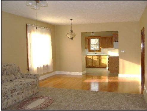
Living Room – 14'4" x 27'4"