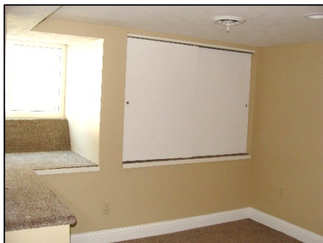
Bedroom – 9'1" x 13'3"