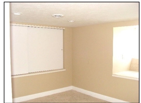
Bedroom – 9'5" x 12'4"