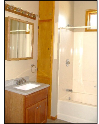
Bath – 9' x 6'4"