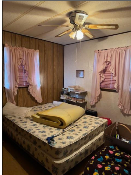
Bedroom 11'6 X 9'8"