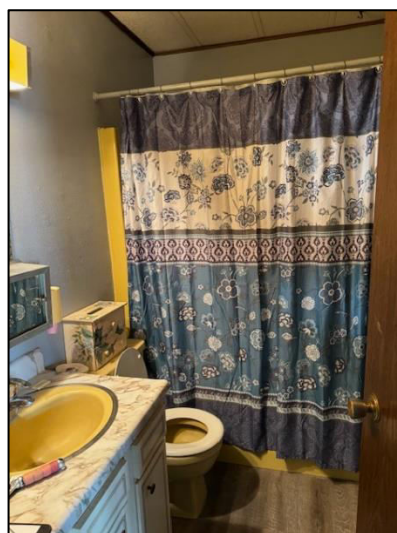
Central Bath 7'9" 4'10"