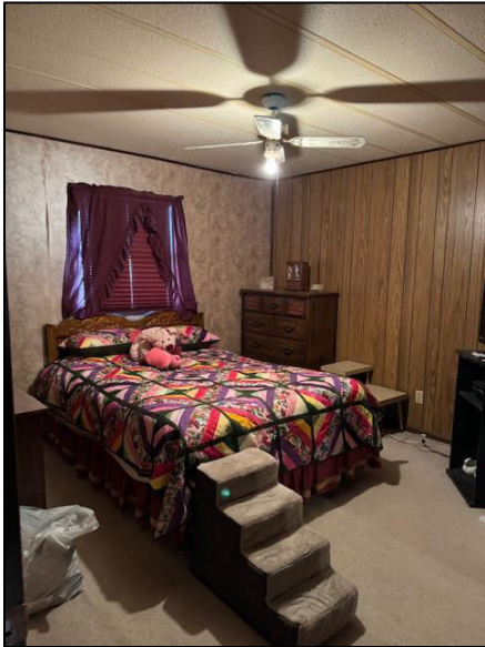
Master Bdrm 11'7" x 13'3"