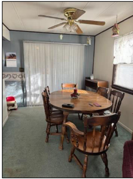
Dining Room – 9'x 11'6"