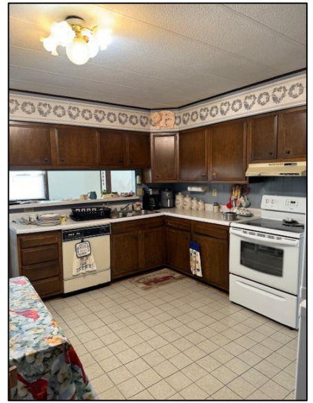
Kitchen 11'7" x 14'