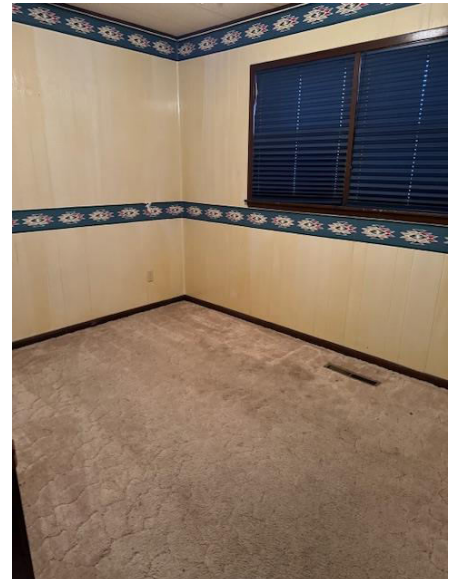
Bedroom 8'2" X 11'3"