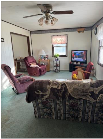
Living room – 11'7" x 21'1"