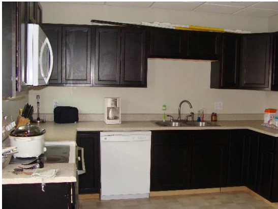
Kitchen – 13'7 1/4" x 11'3"