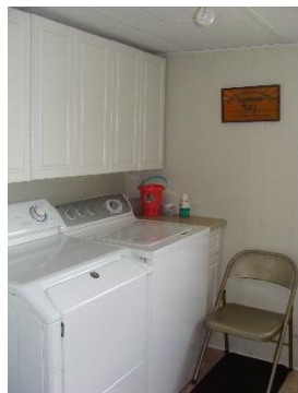
Utility Room – 7'8"x7'10"