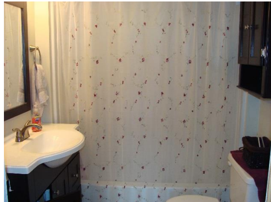
Bathroom – 5'6"x 7'7"