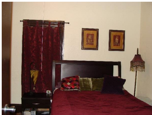
Master Bedroom – 12'x11'3"