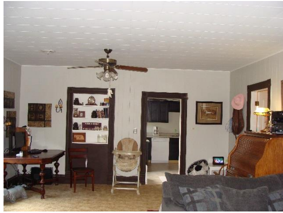
Living Room/Dining Room – 27'3"x 15'6"