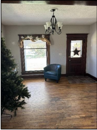
11'5" x 13'7"