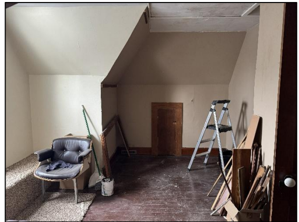
Upstairs Room 11'6" x 15'10"