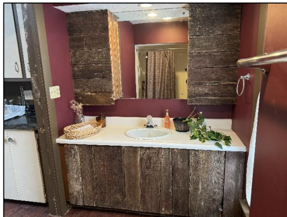
Bathroom 5'7" x 10'11"