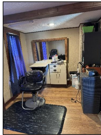
14'4" x 8'2"