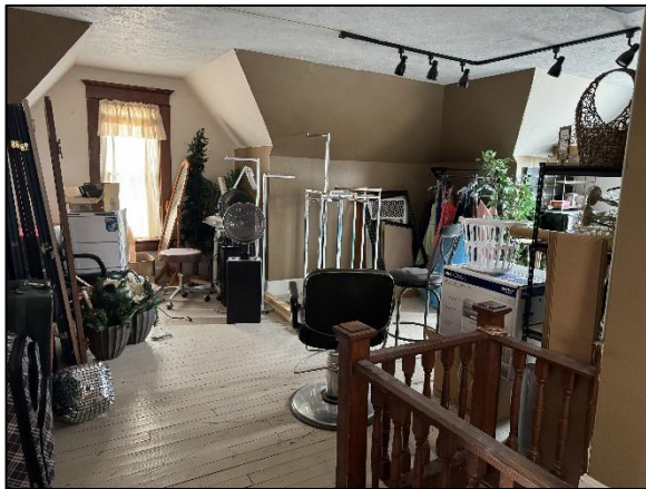
Upstairs Room 19'5" x 23'3"