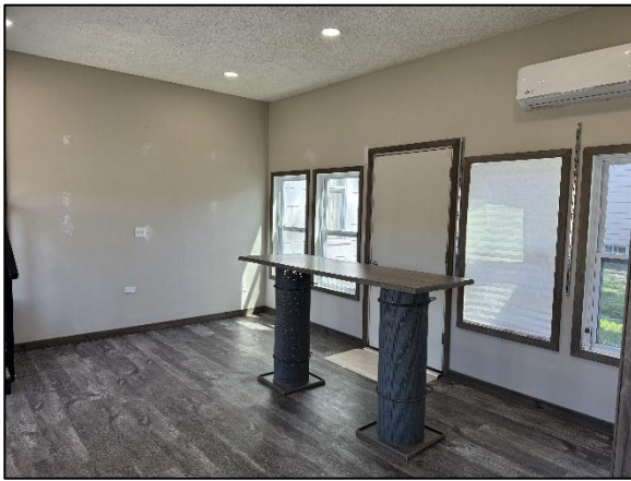
15'11" x 13'4"