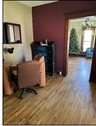
11'6" x 9'3"