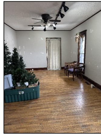
19'6" x 11'6"