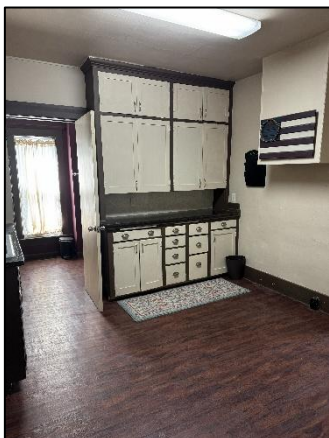
Kitchen 13'7" x 11'3"